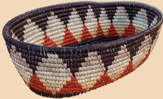
Oval Basket 1

Code | KSB007 Size | 10" x 10" x 2" Price | Rs. 300/-