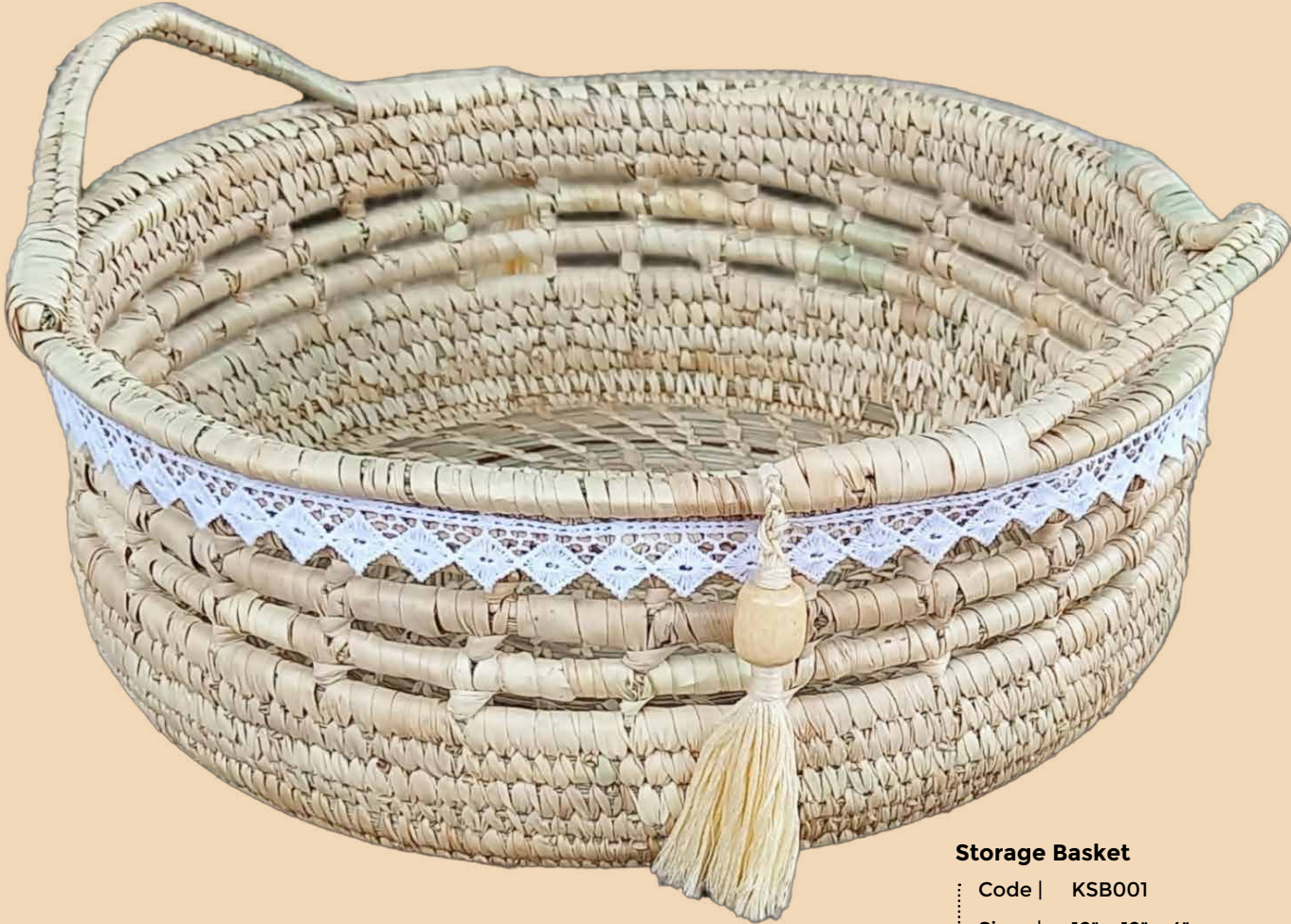
Storage Basket Code | KSB001 Size | 12" x 12" x 4" Price | Rs. 350/-