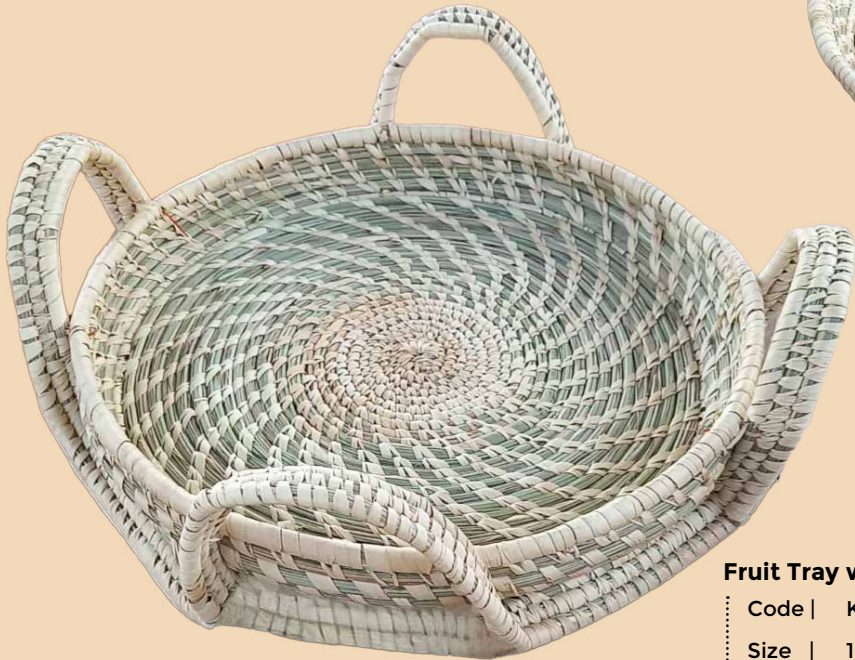
Fruit Tray with 4 legs

Code | KST006 Size | 12" x 12" x 7" Price | Rs. 375/-