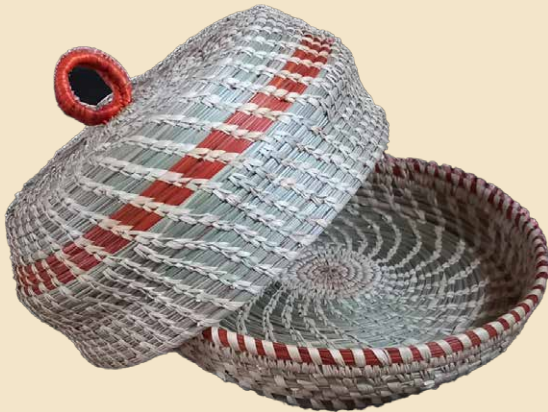
Tray with lid

Code | KST008 Size | 15" x 15" x 3" Price | Rs. 420/-