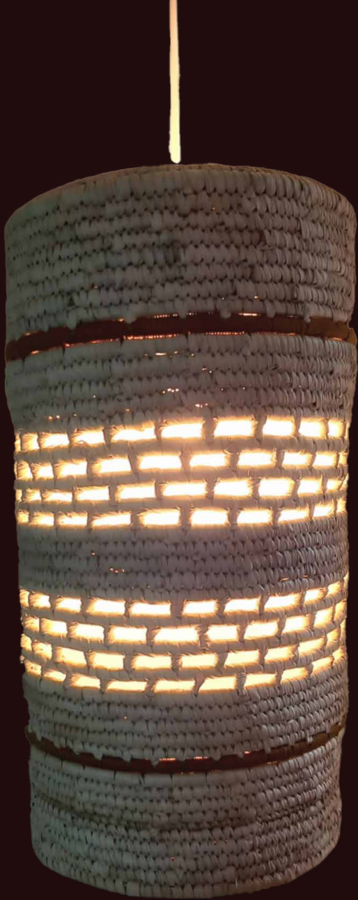
Hanging Lamp 1 Code | KSL001 Size | 12" x 6" x 6" Price | Rs. 450/-