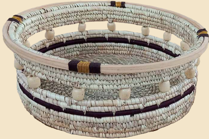
Storage Basket Code | KSB002 Size | 12" x 12" x 4" Price | Rs. 325/-