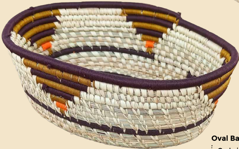
Oval Basket Code | KSB004 Size | 10" x 7" x 4" Price | Rs. 215/-