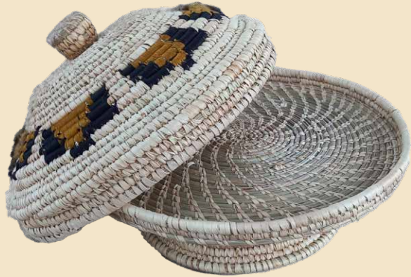
Basket with lid

Code | KSB005 Size | 8" x 8" Price | Rs. 225/-