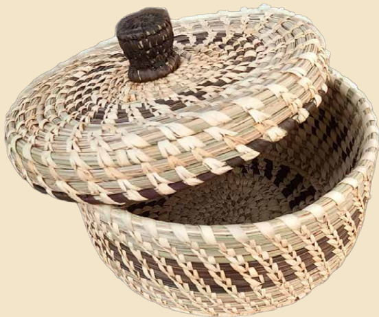
Container 4 Code | KSC004 Size | 7" x 7" x 3" Price | Rs. 297/-