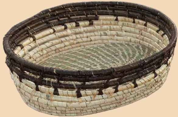
Oval Basket 2

Code | KSB008 Size | 12" x 7" x 4" Price | Rs. 380/-