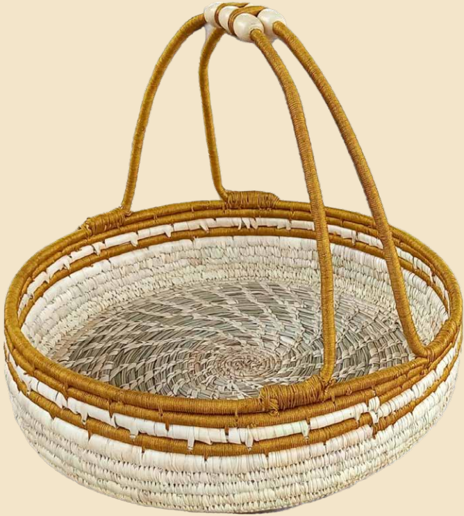
Round Basket Code | KSB003 Size | 11" x 11" x 4" Price | Rs. 360/-