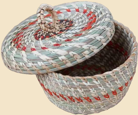
Container 3 Code | KSC003 Size | 7" x 7" x 3" Price | Rs. 297/-