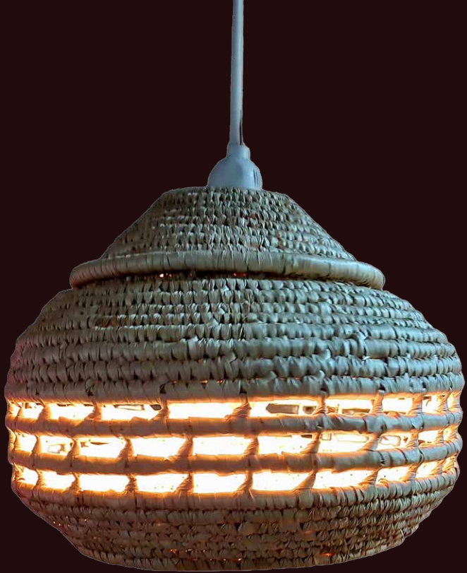
Hanging Lamp 2 Code | KSL002 Size | 7" x 7" x 8" Price | Rs. 335/-