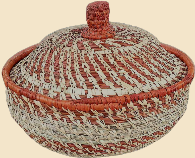
Container 1 Code | KSC001 Size | 10" x 10" x 4" Price | Rs. 450/-