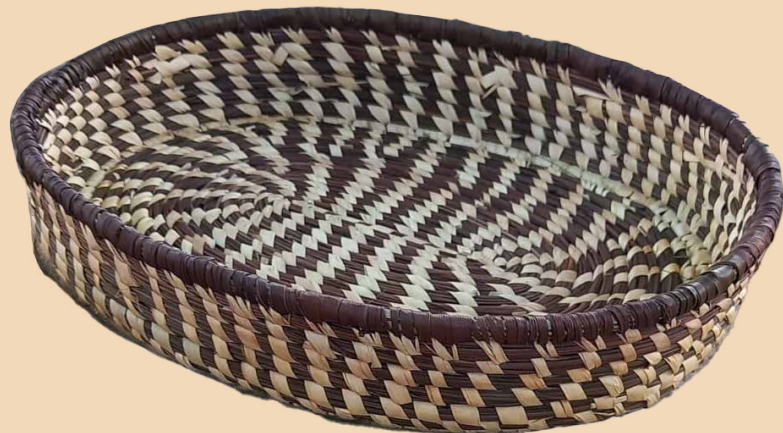
Oval Basket 3

Code | KSB010 Size | 12" x 7" x 4" Price | Rs. 255/-