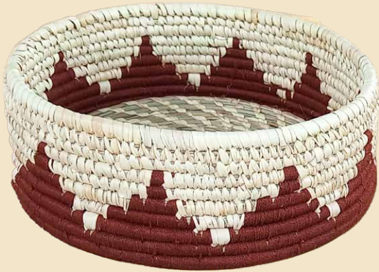
Small Round Basket

Code | KSB005 Size | 8" x 8" Price | Rs. 225/-