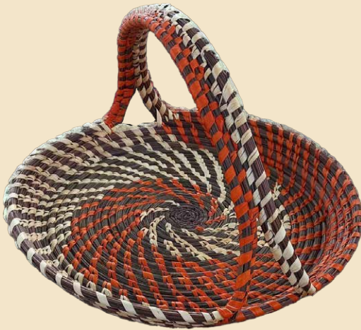
Spiral Tray 2

Code | KST005 Size | 12" x 12" x 7" Price | Rs. 375/-