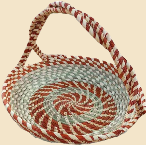
Spiral Tray 1

Code | KST002 Size | 9" x 9" x 2.5" Price | Rs. 295/-